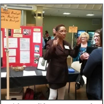
A job candidate promotes her expertise to potential employers

Unlike most traditional job fairs, this innovative recruitment event focused on showcasing talents and professional interests of 80+ job candidates with disabilities. Participants met with potential employers