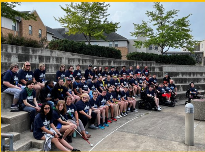
MO-YLF delegates and staff are seated on stairs on MU campus

Throughout the week, the delegates worked on their personal leadership plan and poster to set goals for their future. They were able to grow their leadership skills and learn about helpful resources and future leadership opportunities. The delegates graduated from the MO-YLF after presenting to staff, parents, and guests at the closing ceremony on the last day of the event. We cannot wait to see the great things these young leaders will be doing in their future!