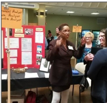
A job candidate promotes her expertise to potential employers

spaces, demonstrating experience and skills in a variety of industries, while human resource professionals roamed the room, meeting the candidates they were interested in hiring. More than 116 recruiters representing 99 area companies were present. With 236 total registrants, not including job candidates, this year's event was the largest yet.