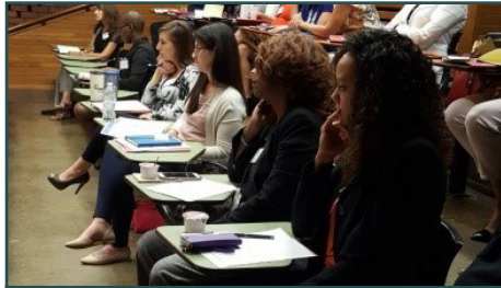
Recruiters participate in workshops on disability inclusion, workplace culture and recruitment

Unlike most traditional job fairs, this innovative recruitment event focused on showcasing talents and professional interests of 80+ job candidates with disabilities. Participants met with potential employers in their booth